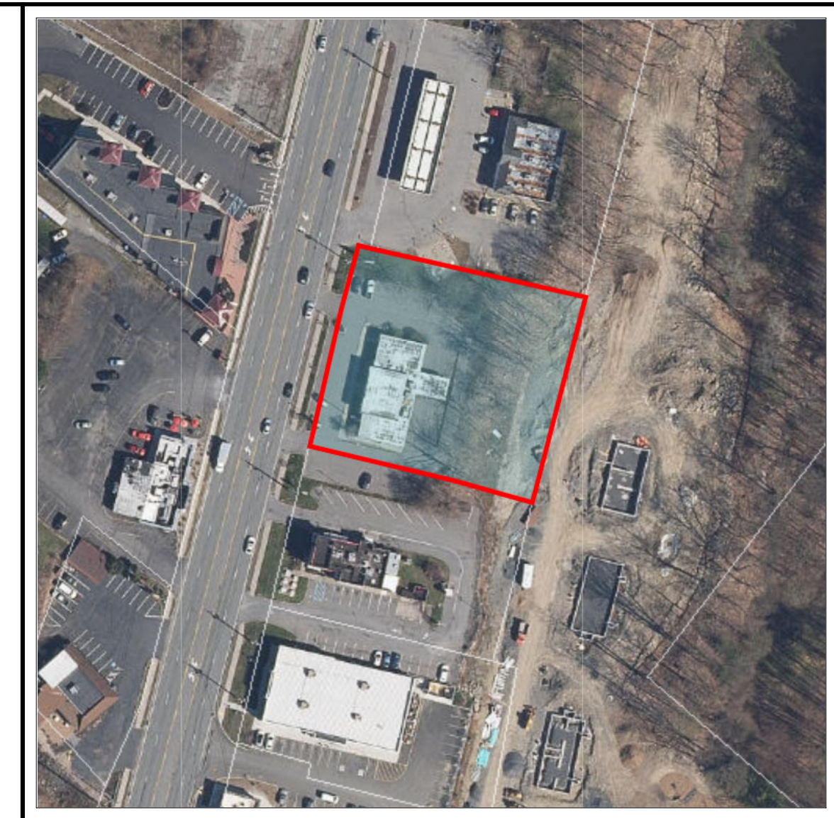
LOCATION MAP SCALE 1"=800'

TOTAL LOT AREA: 0.91 ACRES = 39,640 SQ.FT EXISTING IMPERVIOUS AREA = 23,441 SQ.FT. (60%) PROPOSED IMPERVIOUS AREA = 28,046 SQ.FT. (64%)